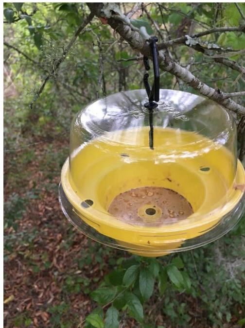
Figure 5. A modified fruit fly trap, similar in design to a McPhail trap. A torula yeast and water mixture was used as a bait.

Both the Caribbean fruit fly, Anastrepha suspensa and the spotted wing drosophila (SWD), Drosophila suzukii , are important agricultural pests known to reproduce in non-crop areas. Traps designed for fruit flies were deployed in NATL (Figure 5). A torula yeast bait was used to lure the target specimens. A total of 61 Caribbean fruit flies and 84 SWD were trapped during the study period of summer 2018, indicating that both these species are abundant in natural areas in Gainesville.