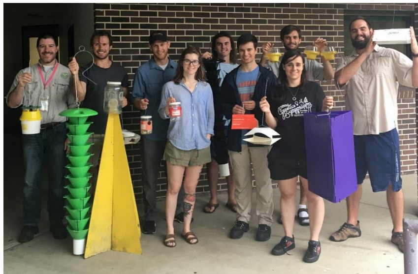
Figure 8. A selection of the traps demonstrated at the NATL trap day event, along with participants.