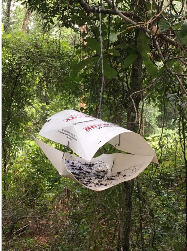
Figure 2. A “wing trap” deployed in NATL during the study period. The trap is lined with a removable sticky card. A borer lure is placed in the center of the trap to attract target moths.