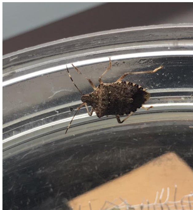
Figure 4. An adult brown marmorated stink bug, Halyomorpha halys , collected from a trap in NATL. *This species is not known to be established in Alachua County.