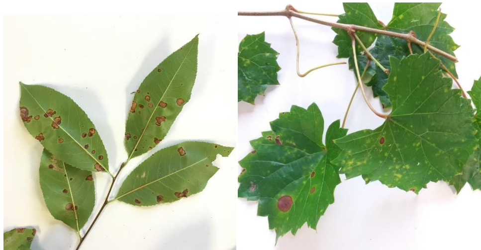
Figure 7. Leaf-spot type symptoms caused by plant pathogens collected on plants in NATL. Identified pathogens shown here include Mycosphaerella sp. on wild cherry (left) and Botryosphaeria and Colletotrichum sp. found on wild grape (right).