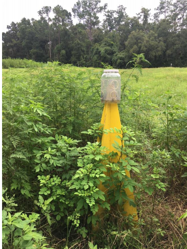
Figure 3. A yellow pyramid trap used to capture stink bugs. The trap is deployed in a field of hairy indigo.

Several yellow pyramid traps were deployed in NATL (Figure 3). This trap design is effective at collecting stink bugs, weevils and several other taxa. The addition of a multi-species pheromone lure increased trap capture.